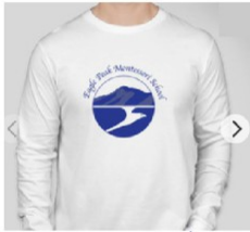
LONG SLEEVE (WHITE) YS-3XL $30