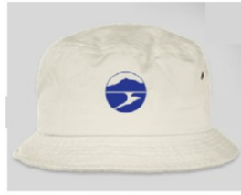
BUCKET HAT ONE SIZE $30