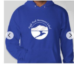
HOODED SWEATSHIRT (BLUE) YS-3XL $40