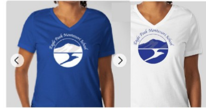
FITTED V-NECK ADULT S-3XL $20