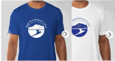
BASIC T-SHIRT YS-4XL $20